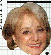
Barbara Walters, lactaphobe.

The disquieting suspicion that the Yankees really are this bad.