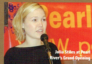
Julia Stiles at Pearl River's Grand Opening

nishings, kitchenware, from Japan, Korea, India, Thailand, Indonesia, and other Asian countries.